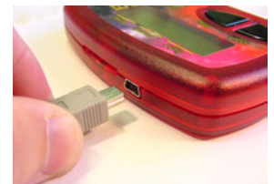
Plug in and your data appears!