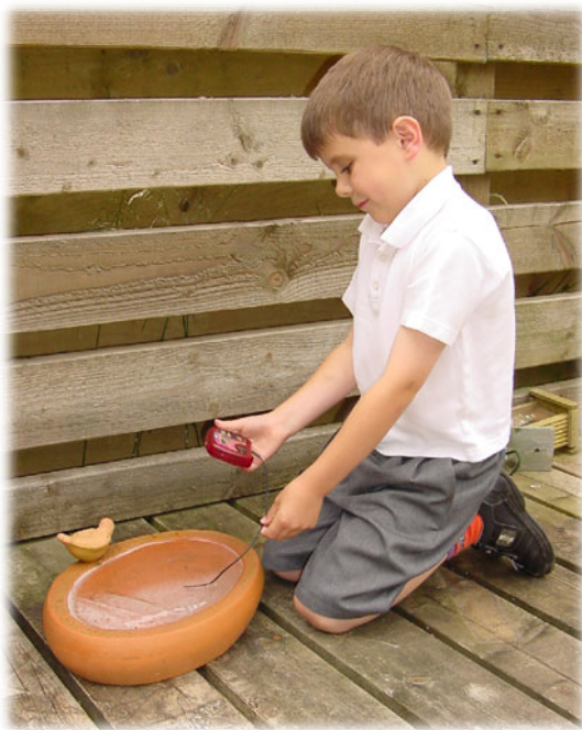
Great for experiments and investigations

Tough! Oh yes, it's designed with the real world in mind. With the weatherproof wallet you can leave EDDI outside for a few days to see how light levels and temperature vary through days and nights and also monitor the rush-hour noise pollution levels.